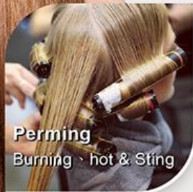
Perming Burning · hot & Sting