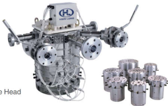
多層模頭 Multi-Layer Die Head

技術、信賴、世界級質量 Technology, Reliable and World-class Quality